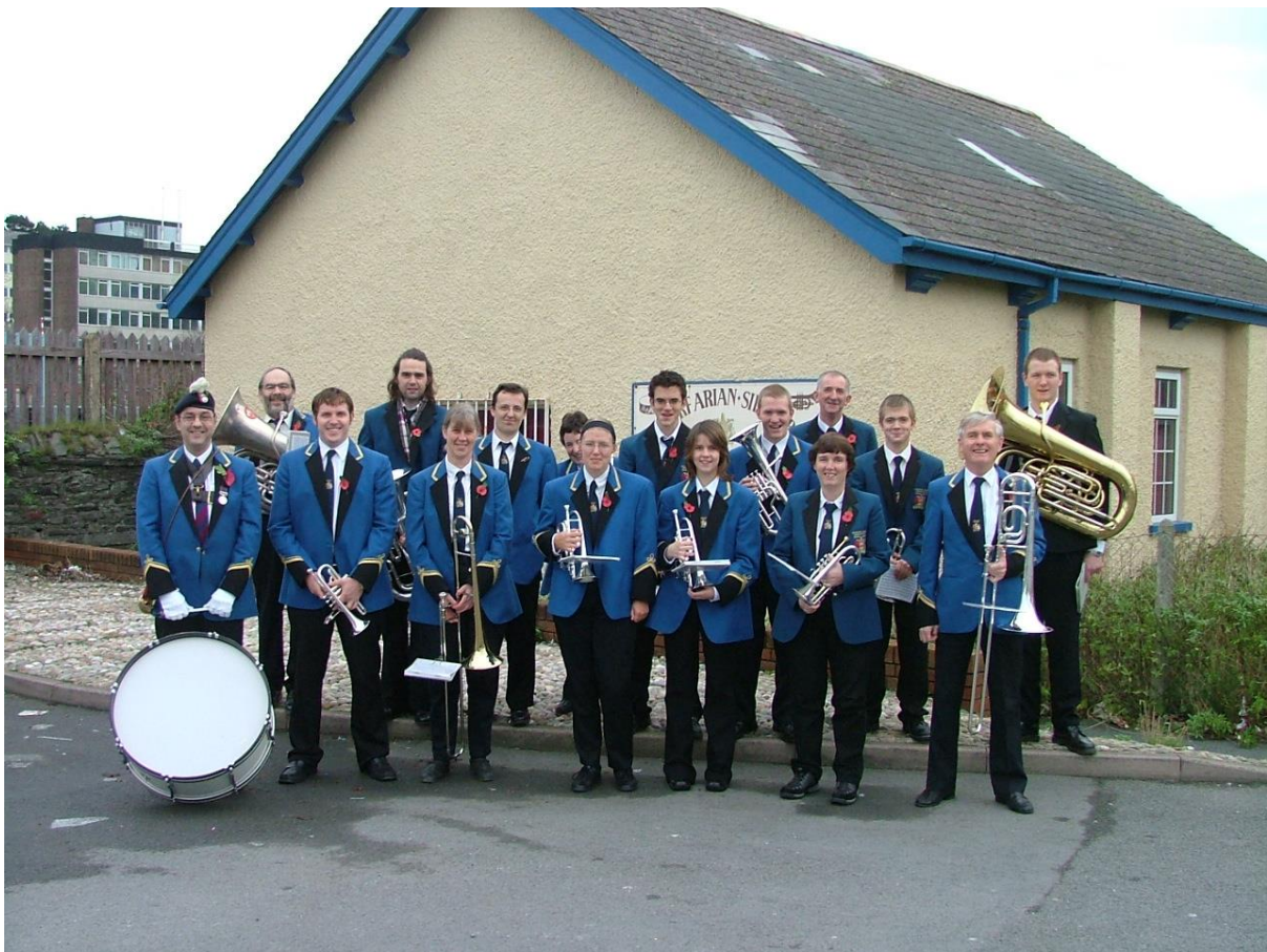
Below: Showing the new Entrance and porch, the band gathers for a photograph before marching off to lead the remembrance parade in November 2008.