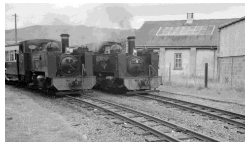
Above: Two VOR trains in front of the bandroom and crew boarding a train that's preparing to depart for Devil's Bridge hauled by no. 8 Llewelyn. On the other side of the bandroom boundary wall was the