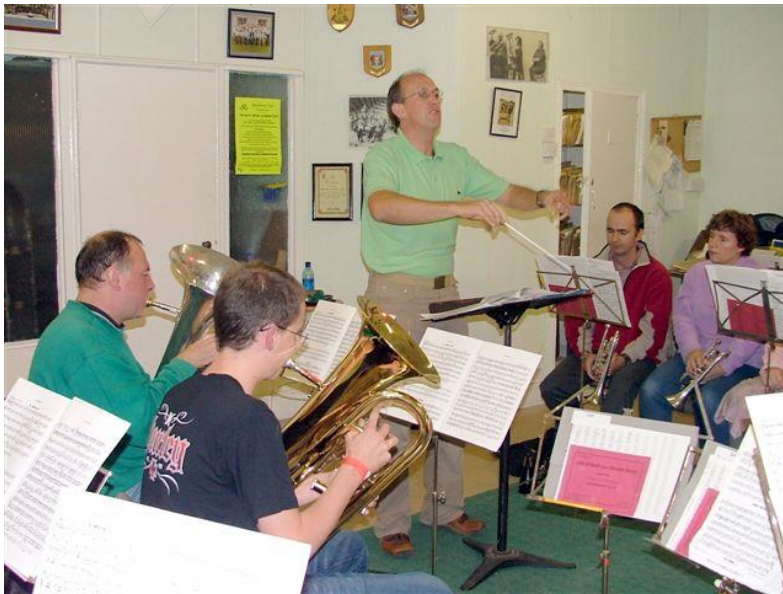
Below: Before the redevelopment of the car park and Bandroom entrance began, the band is seen on November 14 th 2004 before the leading the annual Remembrance Day parade.