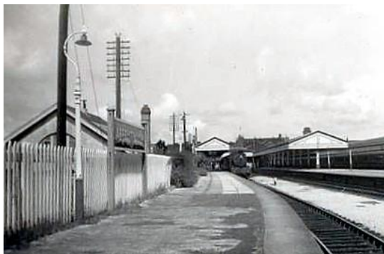
Above: A passenger steam train waiting to depart for Carmarthen in the early 1960s. The bandroom is on the left.