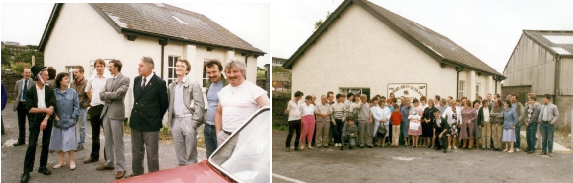
Above: Members of both Aberystwyth and Middleton band outside the bandroom in 1985.

In 1985 the Middleton Band near Cork in Ireland visited the town for a musical weekend..