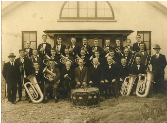
Aberystwyth Silver band and officials outside the recently completed bandroom in 1926

Previous to 1926 the town band relied on the use of a rehearsal room in the enclosed skating rink next to Capel y Morfa opposite the former town hall, now Ceredigion Library. It never was satisfactory and being in a residential area they suffered regular complaints following their rehearsals. The decision was made by the Aberystwyth Borough Council to build a new band hall on the perimeter of the town in Smithfield, an area well known previously for its many foundries, smithies and slaughterhouse. The benevolent Aberystwyth Borough town council, from its funds, built the current bandroom dedicating its use to the town band. Also funds were raised by the people of the town towards the purchase of a complete set of